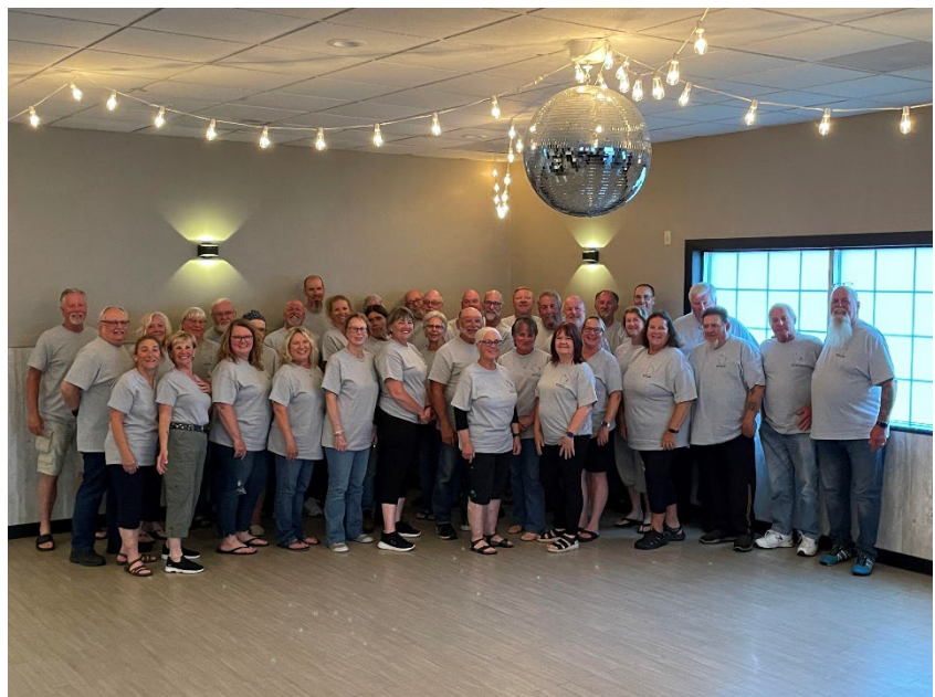
The 2022 River Runners