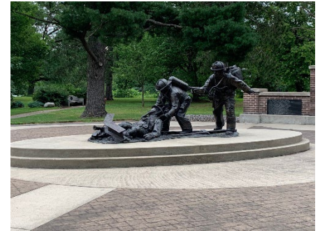
BELOW: Statue dedicated to all the Wisconsin Fire and EMS workers who lost their lives in the line of duty.